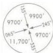
MSA GDL VOR