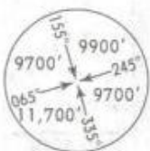
MSA GDL VOR

Alt Set: MB (IN on req) TDZ Elev: 171 MB Trans level: FL 195 Trans alt: 18500' 1. In case of DME failure at any point during the procedure, maintain last assigned altitude and proceed to the station in accordance with ATC instructions.